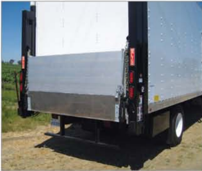
WDV Series Gate in stowed position offers simplicity and reduced maintenance