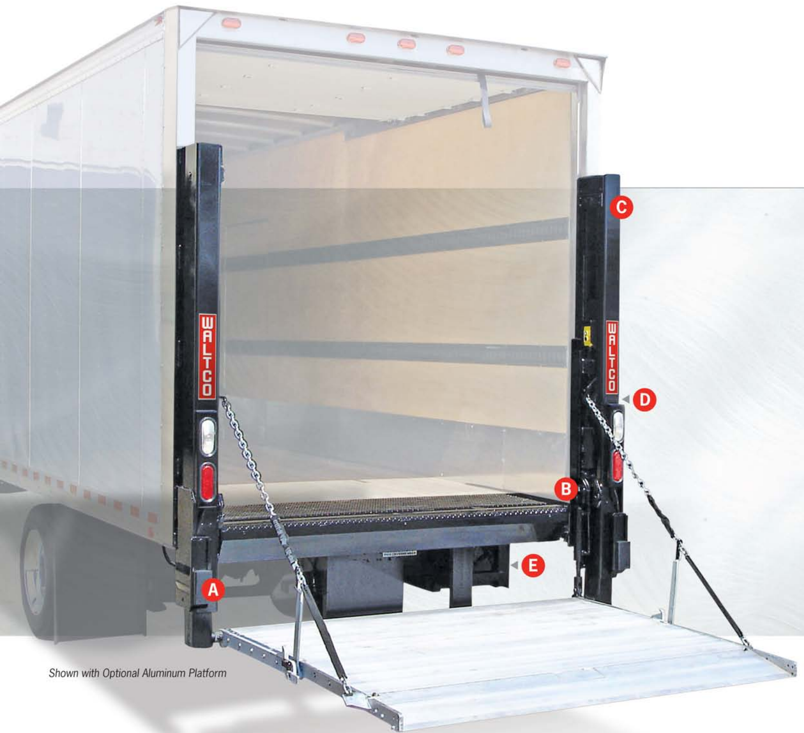
Shown with Optional Aluminum Platform